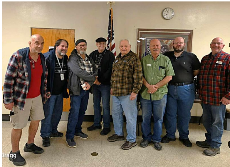
The new Board of Directors for KCCVARC